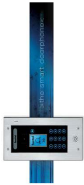
FT25K : standalone keypad